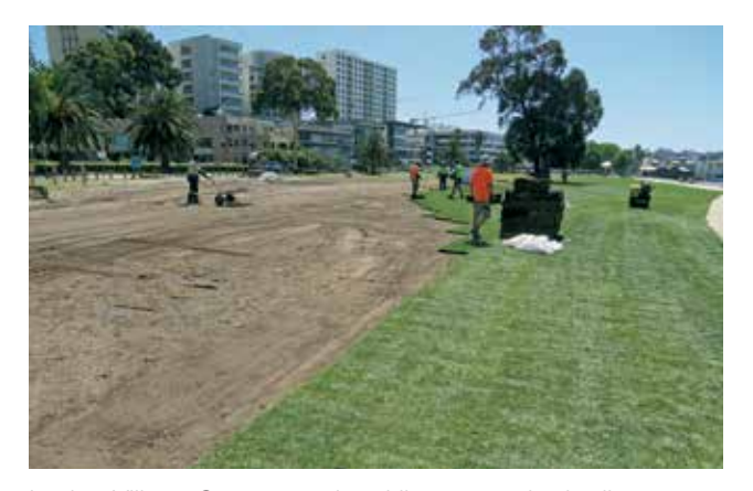
Laying Village Green premium kikuyu standard rolls