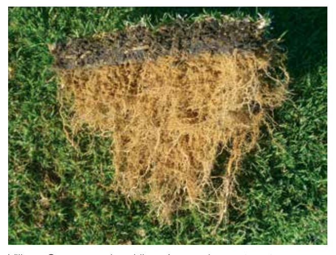
Village Green premium kikuyu's massive root system