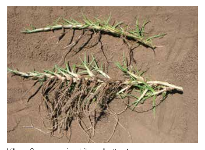
Village Green premium kikuyu (bottom) versus common kikuyu (top) stolons