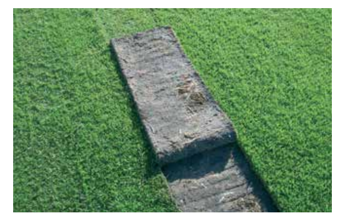
Quality Village Green premium kikuyu