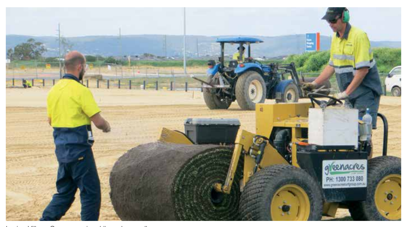
Laying Village Green premium kikuyu large rolls