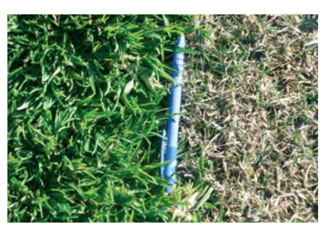
Village Green premium kikuyu (left) versus couch (right) in winter