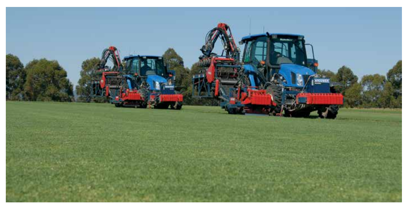
Harvesting Village Green premium kikuyu

For a list of local suppliers please go to www.villagegreenturf.com.au