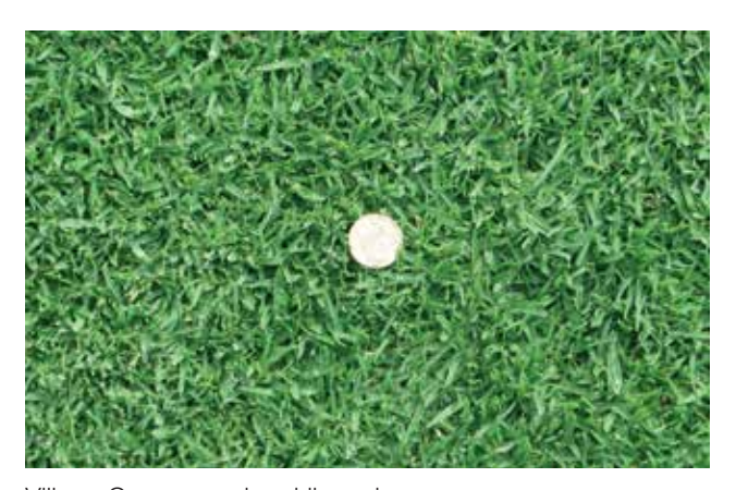
Village Green premium kikuyu low mown