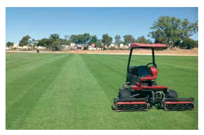
Triplex finishing mower provides a quality finish