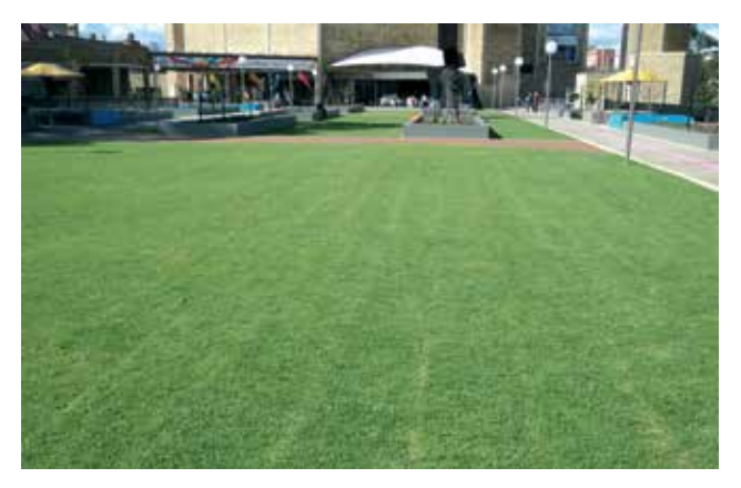
Well laid job