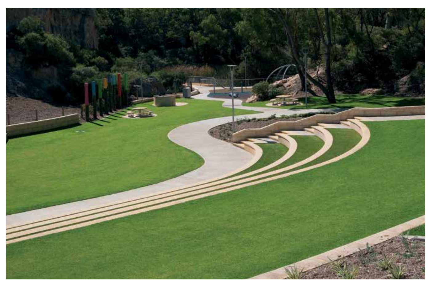
Meadow Springs Mandurah