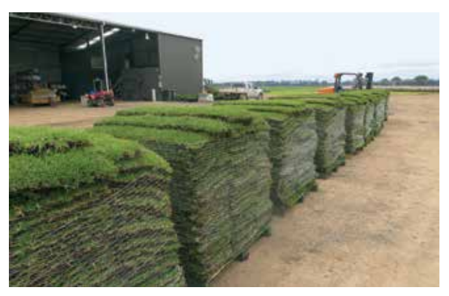
Village Green premium kikuyu slabs

Village Green premium kikuyu tested at Exhibition Park Canberra during July. Three weeks later after subzero temperatures it still has a green cover and well established roots.