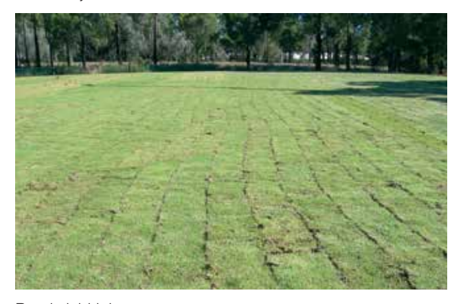
Poorly laid job